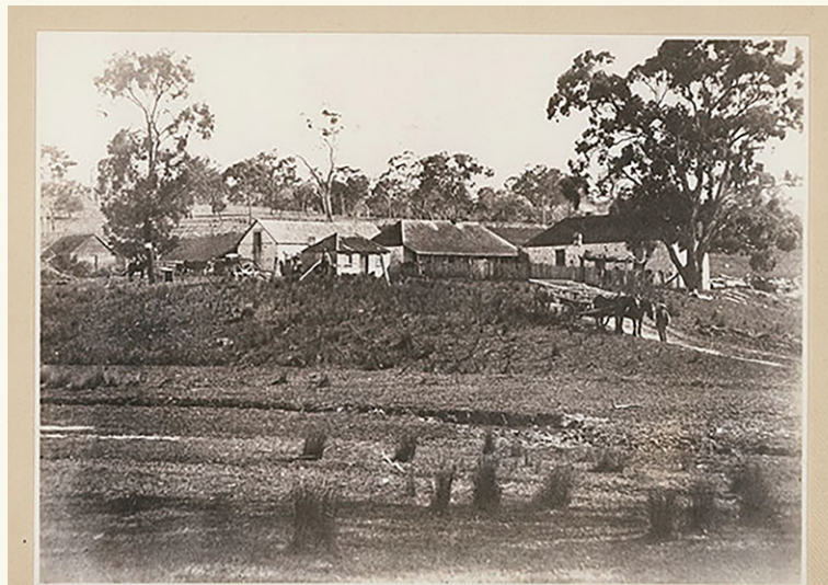
Emu Bottom. Copy of original photo taken early 60's