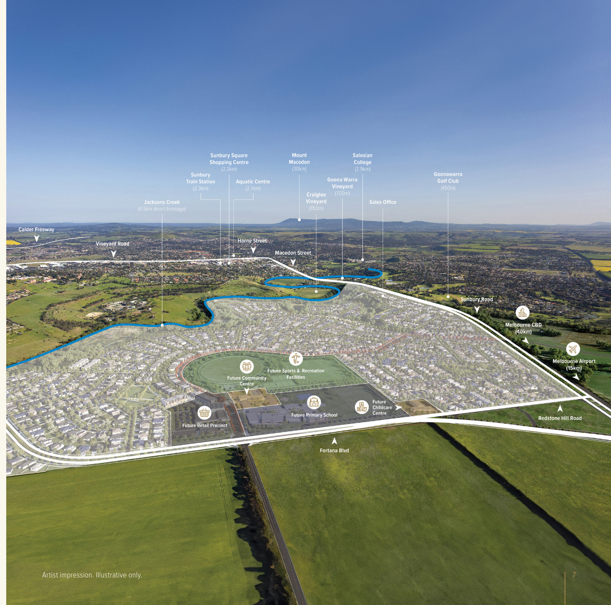
Artist impression. Illustrative only.

Opening the eastern side of Jacksons Creek allows residents the opportunity to explore the many bike and walking paths, scenic lookouts, and open space by the waterfront. The central placement of sports facilities within the community also serves as a testament to Everley's dedication to fostering a healthy and active lifestyle, while the wide array of housing options meets the needs of a growing population and dynamic community.